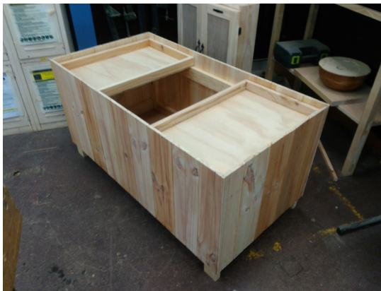
Brooke Brown (blanket box)