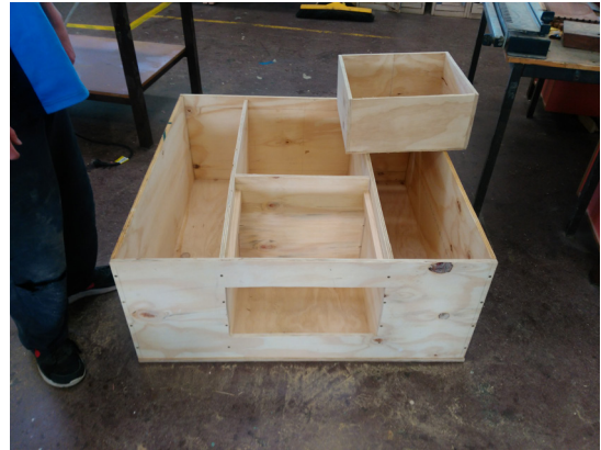
Deejae Griffiths (modular bed)