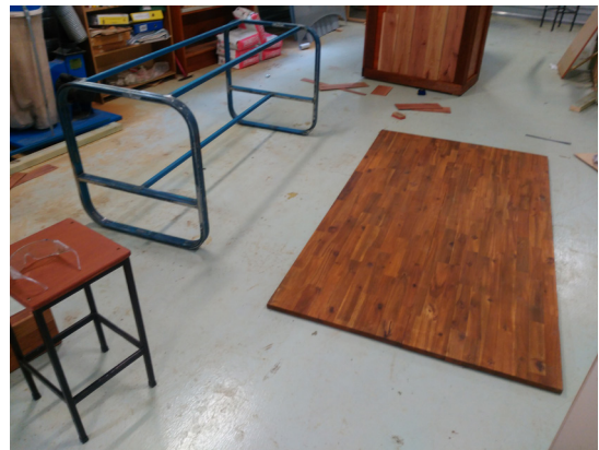
Hamish Starr (outdoor table)