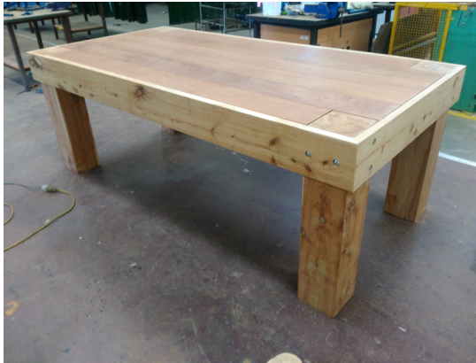
Selwyn White (outdoor table)

Throughout 2017 Year 12 have been working hard to design, manage and produce projects as part of their HSC. Projects include an outdoor table, modular bed, blanket box and a bar. Students are still completing their projects but are happy with their progress.