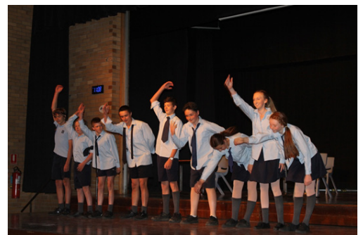
2016 successful Junior Ensemble performing Revolting Children at Grandparents Day.

Bring own lunch, snacks, comfortable clothes, water, lots of energy and a positive attitude.