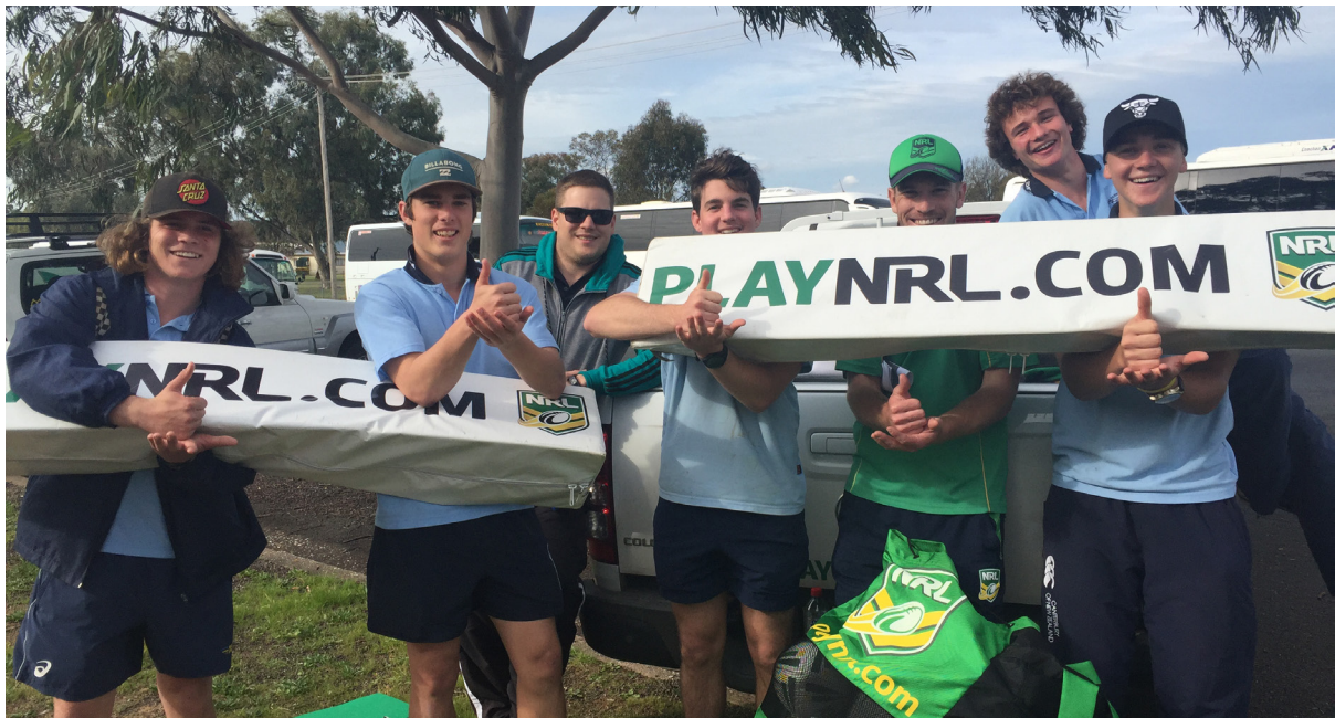
The Henry Lawson High School sports coaches completed their Rugby League Modified Games coaching certificate thanks to Western NRL Development and school partnerships with Grenfell Public School.